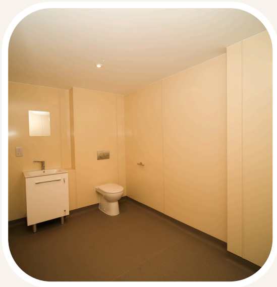
Ensuite / wet rooms

All bedrooms are designed to the highest spec, with quality furniture fit for purpose