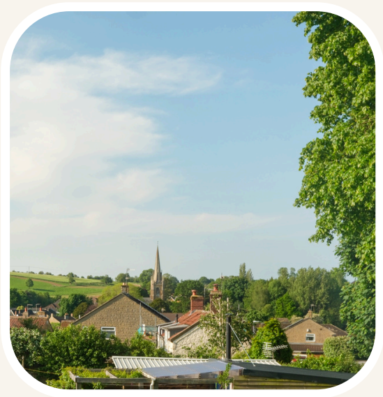
Stunning bedroom views