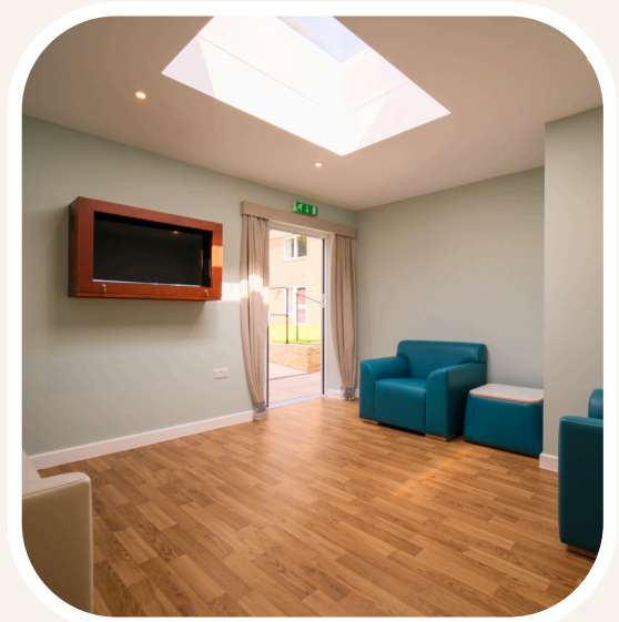
Shared living room